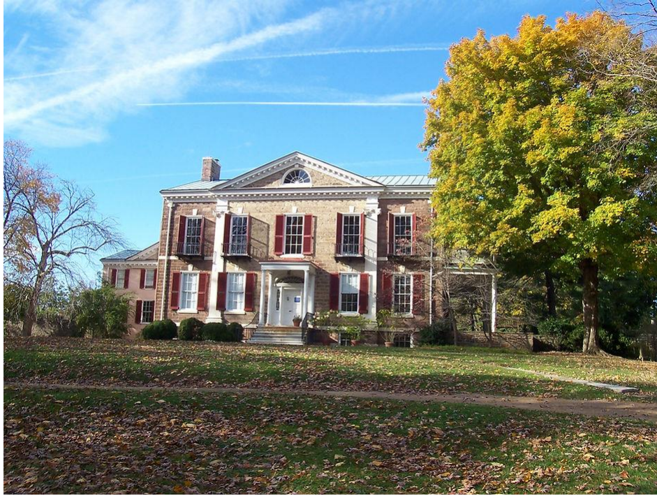
The Highlands Mansion in Fort Washington