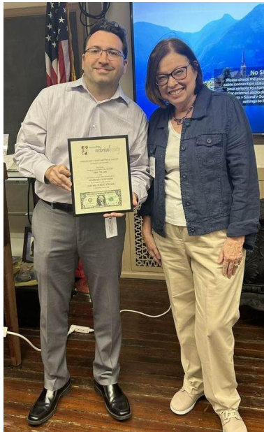
New Whitpain Manager Receives $1

WVHS Dues are Due: September 1 st marked the beginning of a new school year and the beginning of the WVHS Society Year, 2024-2025. Dues remain the same as last year. Although WVHS is an all-volunteer organization, it still has expenses, so many members “round up” to help WVHS with its expenditures for speakers’ fees, insurance, heating oil, archival supplies, and the like. For details about Membership Levels and Payments (online or by mail), please go to