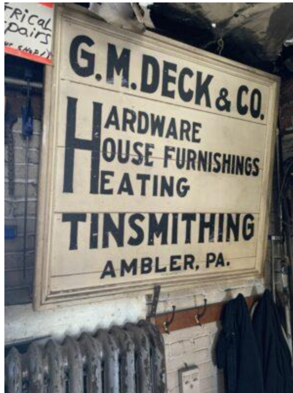
The Deck business started as tinsmithing