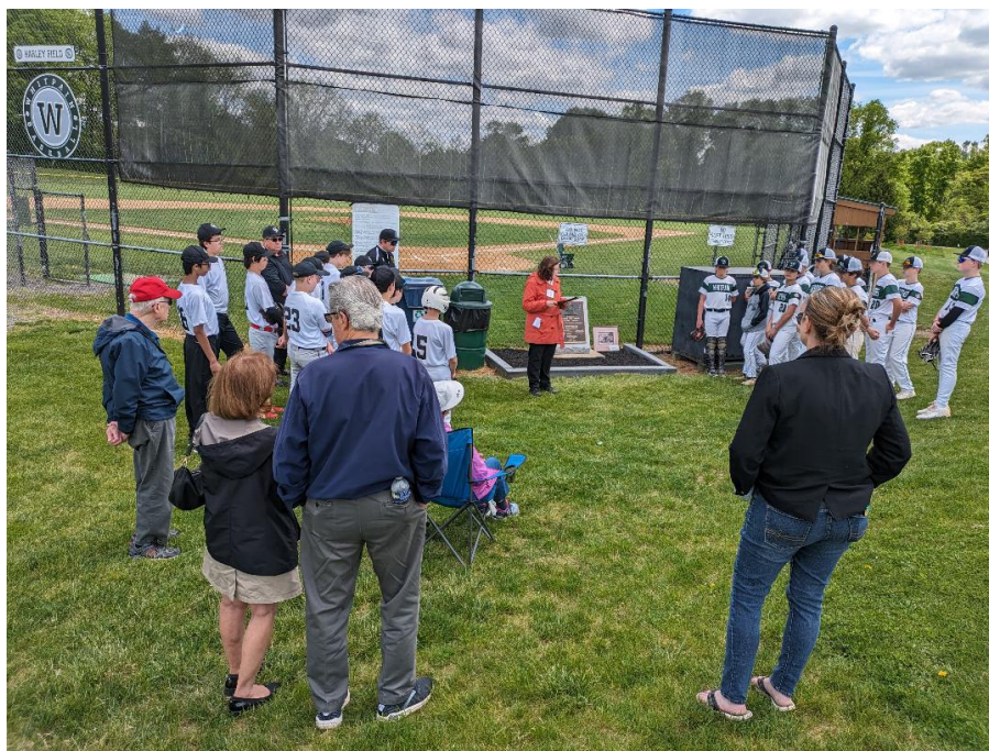
Connie Mack League Players hear about the history of the Boxwood Farm, now the Wentz Run Park