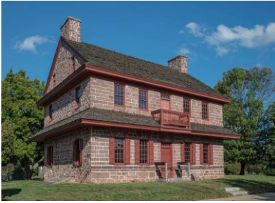
Henry Muhlenberg's House