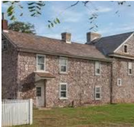
The Speaker's House