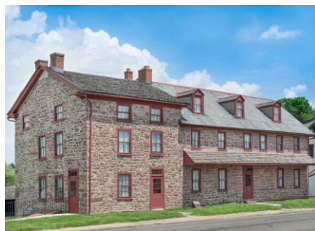
The Dewees Tavern

Street parking may be limited. If you need a ride, or if you can offer a ride, please contact info@WValleyHS.com .