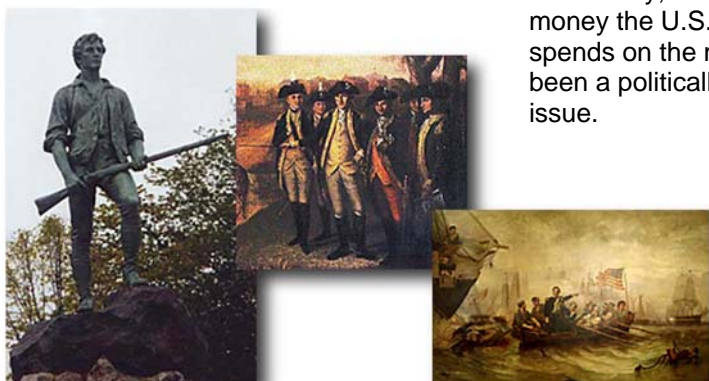
Pictured left to right: Lexington Minuteman representing militia minuteman John Parker;

As of 2006, the U.S. military consisted of an Army, Navy, Air Force and Marine Corps under the command of the United States Department of Defense. There also is the United States Coast Guard, which is controlled by the Department of Homeland Security. In each of these branches of military, the President of the United States is the commander in chief of the armed forces. In addition, each state has a National Guard commanded by the state's governor and coordinated by the National Guard Bureau. The President of the United States has the authority during national emergencies to assume control of individual state National Guard units.